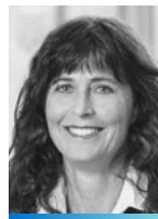
Chief of Staff