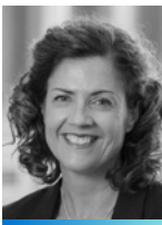
Acting Executive Director Markets Enforcement