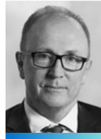
Executive Director Financial Services Enforcement