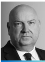
Chief Operating Officer