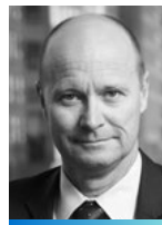
Executive Director Markets