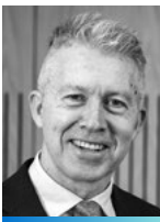
Executive Director Strategy