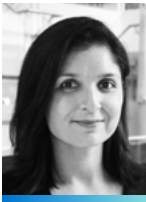
Acting Executive Director Financial Services and Wealth