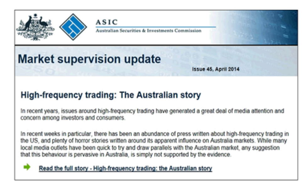
Figure 1: Market supervision update—Issue 45, April 2014

Note: You can subscribe to the MSU, or access previous issues, at <u>www.asic.gov.au/</u><u>ASIC-market-supervision-update</u>.