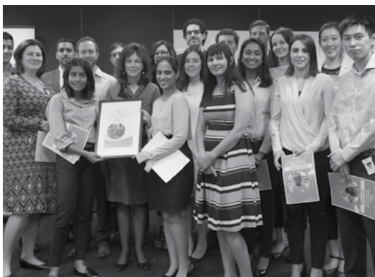
The Indigenous Literacy Foundation presentation to ASIC staff in November 2016.

ASIC in the Community facilitates national fundraising events in all our offices. In 2016–17, we raised $29,008.