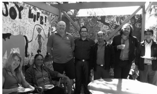
ASIC's Indigenous Outreach Program meeting with members from CentaCare in Katharine, Northern Territory in July 2016.