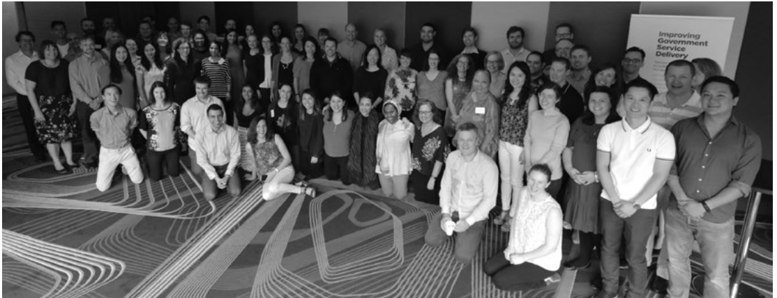
ASIC's Deposit Takers, Credit and Insurers team members at their strategy offsite in April 2017.