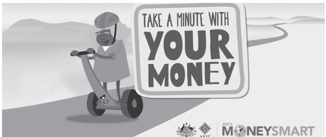
ASIC's 'Take a minute with your money' videos officially launched on ASIC's MoneySmart website in July 2016.

We also continued working with credit and financial services businesses to ensure appropriate outcomes for Indigenous consumers. This included obtaining a voluntary undertaking from a consumer lease provider that delivered more than $108,000 in compensation to a group of predominately Indigenous customers in regional New South Wales.