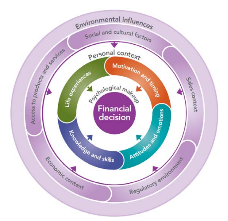
Figure 1: Influences on financial decision making

consumer's life stage and past experiences, psychological, social and cultural factors, and other external environmental factors: see Figure 1.